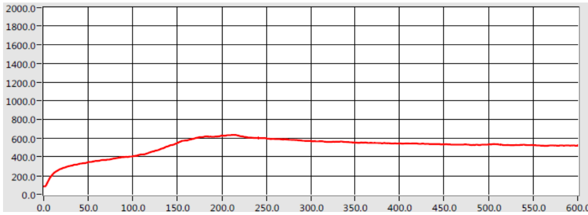
Graph No. 3 – Tunnel Air Temperature Versus Time