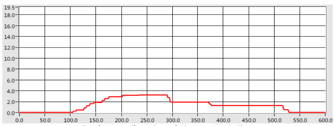
Graph No. 1 - Flame Spread Distance Versus Time