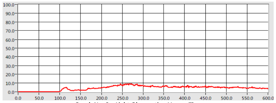
Graph No. 2 – Light Obscuration Versus Time